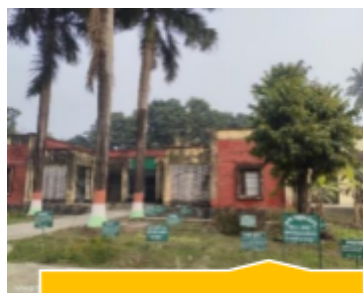
Aromatic and medicinal plants