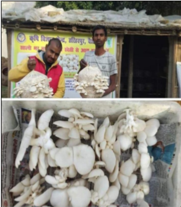
Oyster Mushroom Production