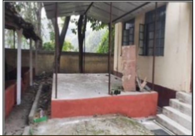
Threshing floor & Mushroom preparation Floor