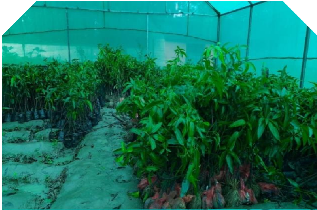
Planting material produced