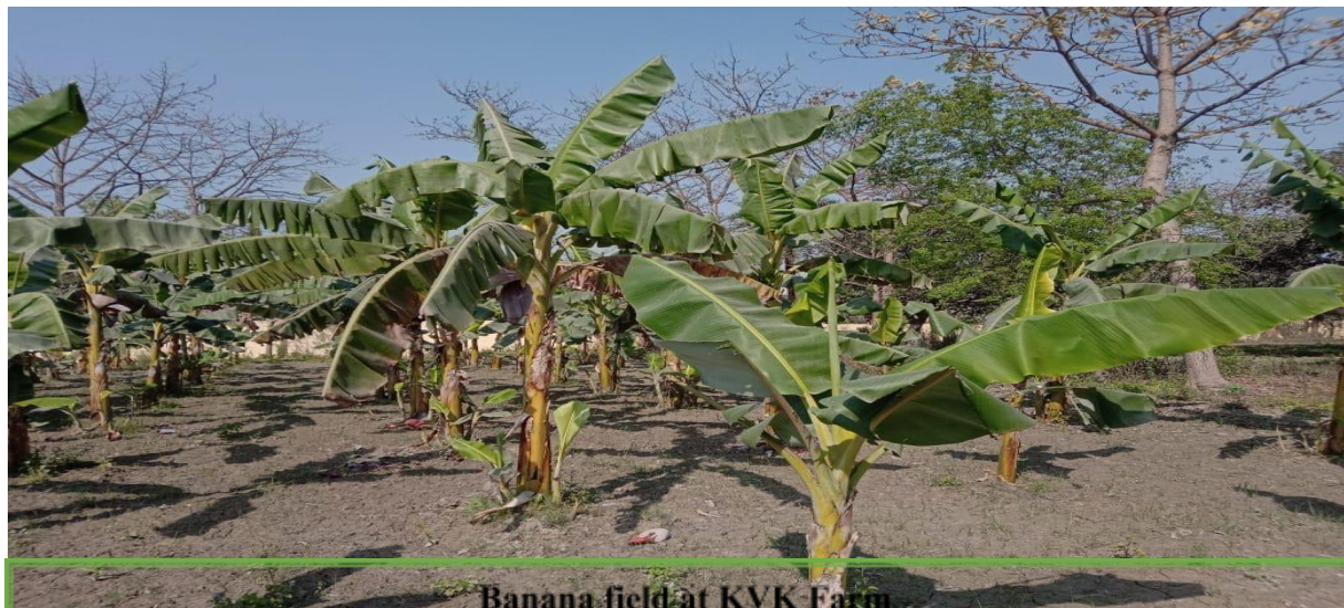
Banana field at KVK Farm