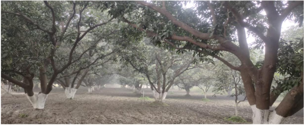
Mother Plant Mango Nursery