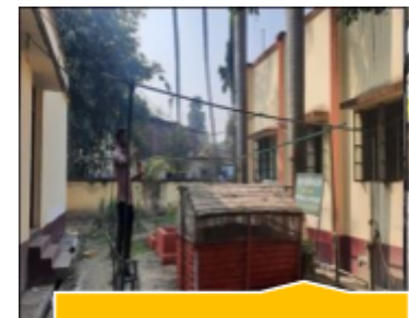
Zero energy cool chamber