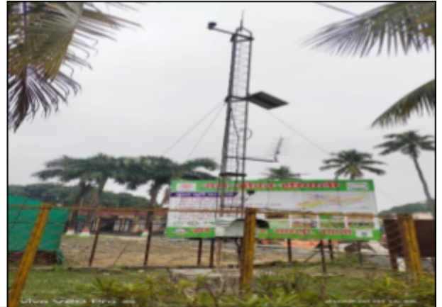
Banana fiber Extraction machine & Agromatrolology