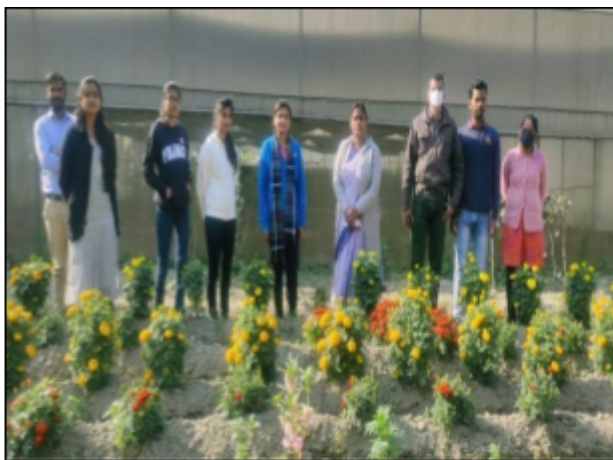
Zero energy cool chamber & Floriculture Unit