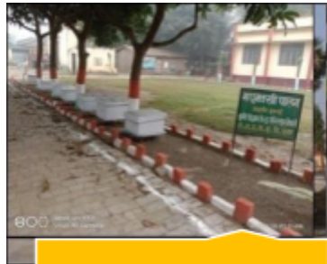
Bee keeping unit