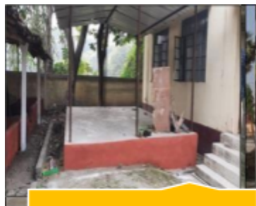
Mushroom composting floor