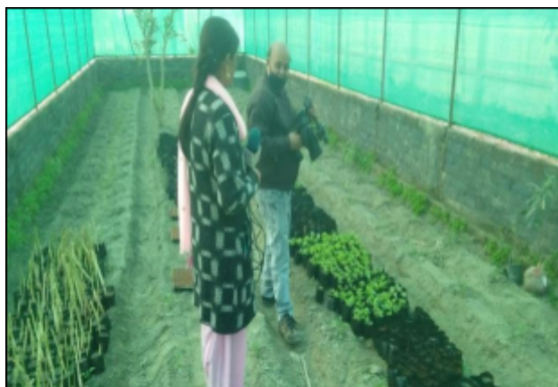
Production in Shade Net House