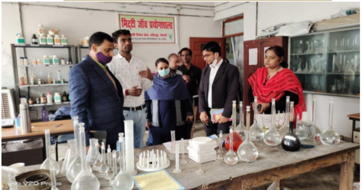
Soil Testing Laboratory