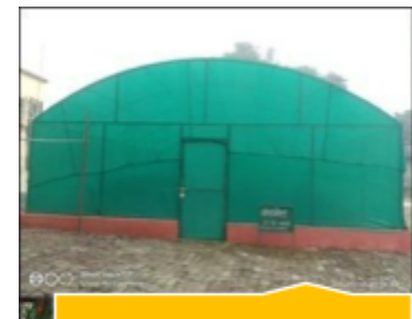
Shade net house