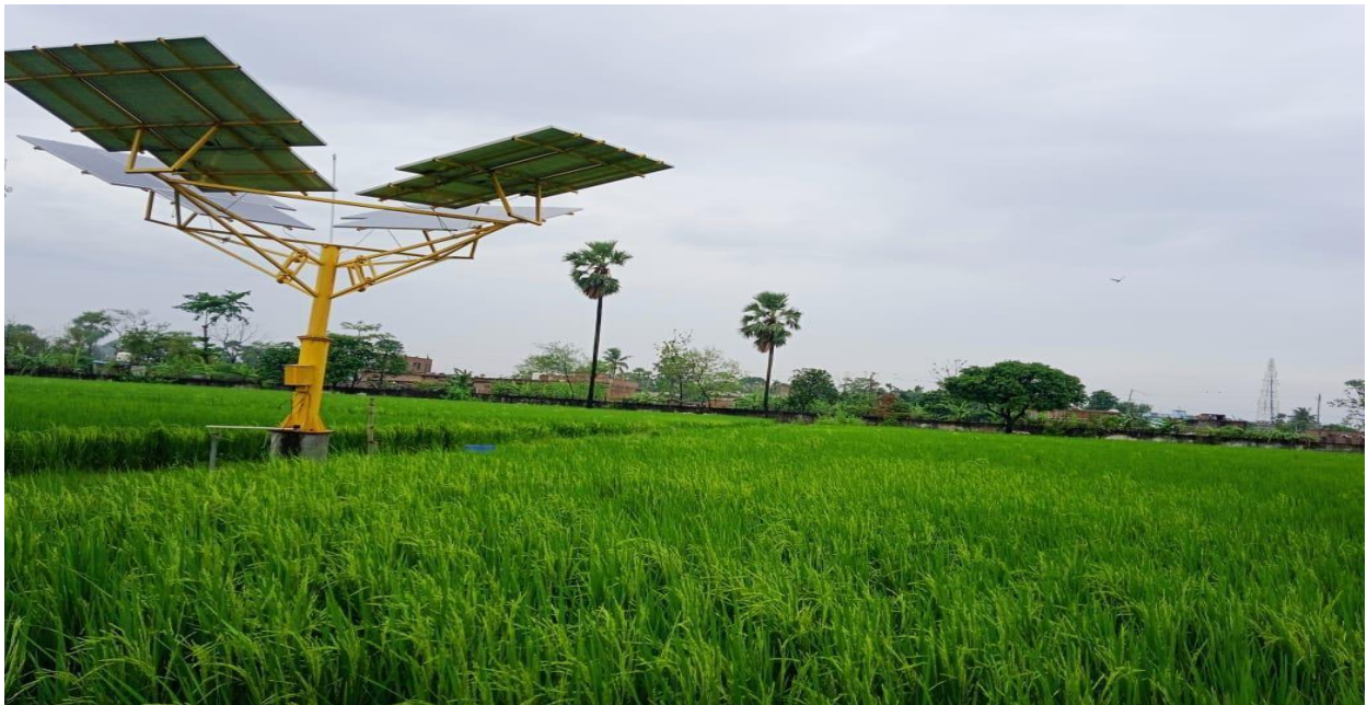
Solar Tree for Irrigation at Farm