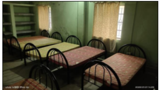
Accommodation facilities in Kisan Ghar