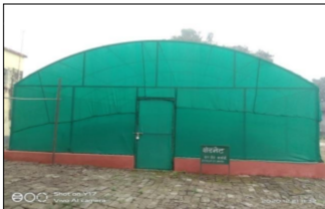
Shade Net House