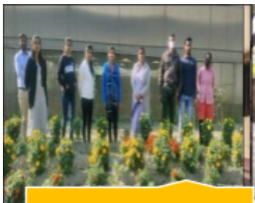
Floriculture at KVK