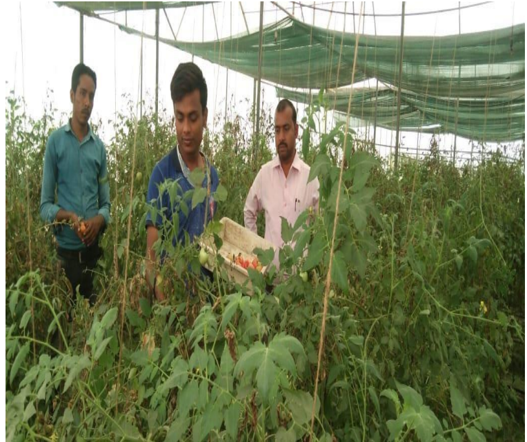
Polyhouse: Vegetable Cultivation