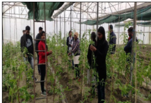
Production in polyhouse