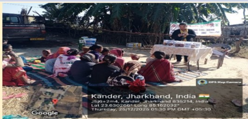
Preparation of Complimentary flour mix under OFT on Development of Complimentary food mix to reduce malnutrition among children (assessment)