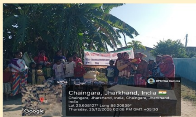
Input distribution under OFT on Development of Complimentary food mix to reduce malnutrition among children (assessment)