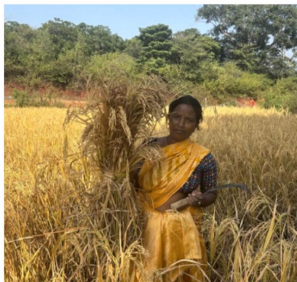
FP: IR64 (drt) at maturity stage