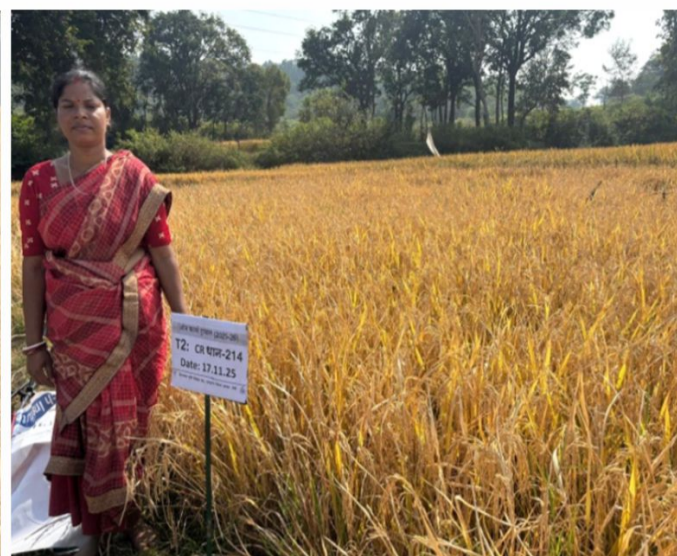
T2: CR Dhan 214 at maturity stage