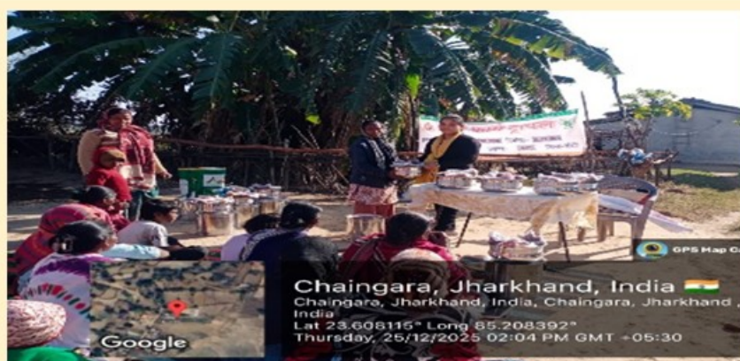
Input support for OFT