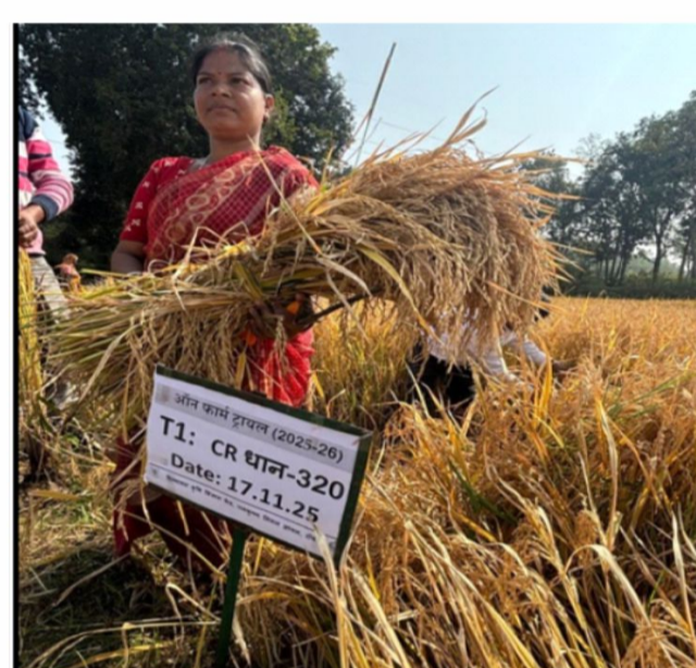
Crop cutting of rice under OFT