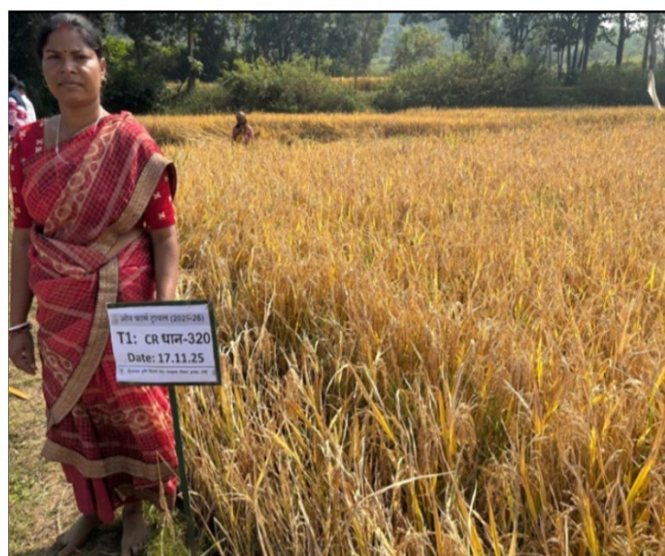
T1: CR Dhan 320 at maturity stage