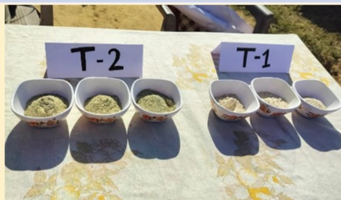
Developed product of To1 and To2 under OFT on Development of Complimentary food mix to reduce malnutrition among children (assessment)