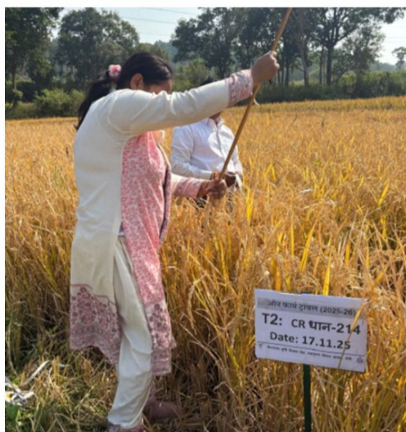
Data Recording at OFT Field