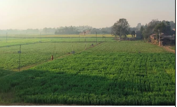
Performance zero-till wheat