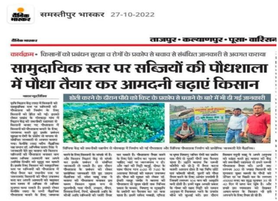
News Paper Coverage