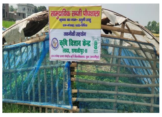
Low-cost poly house at Farmer's field