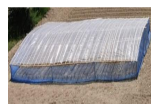
Low-cost poly house- At KVK, Farm

Impact factor : Round-the-year vegetable seedlings production in low-cost poly house very much benefitted and adopted around 150 small and marginal farmers after conducting training programme and showing demonstration unit of KVK, Lada.