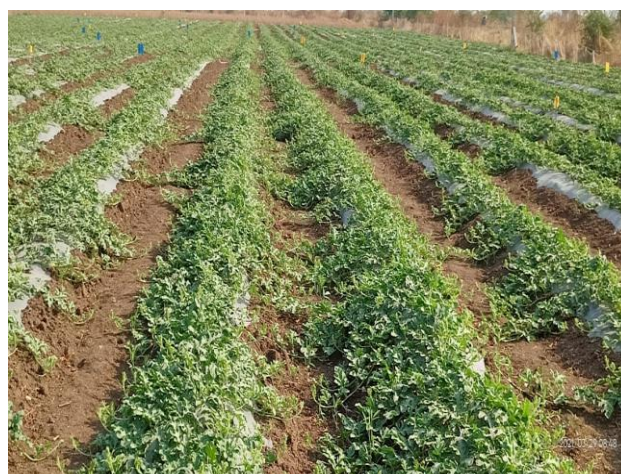
Watermelon plantation on mulching