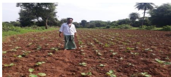
Elephant Foot yam Field

Brief: The farmer used to get annual income of Rs. 21600.00 from Rice, Maize, Tomato, Ladyfinger, and Cow etc. He faced problems like unavailability of critical inputs in local market and financial support from bank. With DFI interventions like creation of irrigation facility, Use of improved variety etc. Now, he is getting annual income of Rs. 52600.00 which is Rs. 149700.00 more compared to base year 2016-17.