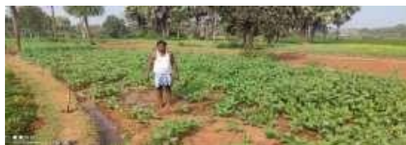
Pigeon Pea Field

Brief:: The farmer used to get annual income of Rs.88600.00 from Rice, Maize, and Cow etc. He faced problems like unavailability of critical inputs in local market and financial support from bank. With DFI interventions like creation of irrigation facility, Use of improved variety etc. Now, he is getting annual income of Rs. 371520.00 which is Rs. 282920.00 more compared to base year 2016-17 i.e. 319.3 % increase in income in 2020-21.