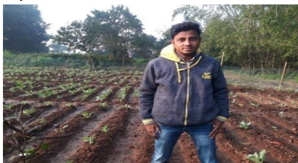
Pigeon Pea Field

Brief- The farmer used to get annual income of Rs. 48575.00 from Rice, Maize, Tomato, Ladyfinger, and Cow etc. He faced problems like unavailability of critical inputs in local market and financial support from bank. With DFI interventions like creation of irrigation facility, Use of improved variety etc. Now, he is getting annual income of Rs. 155720.00 which is Rs. 187145.00 more compared to base year 2016-17 i.e. 439.5 % increase in income in 2020-21