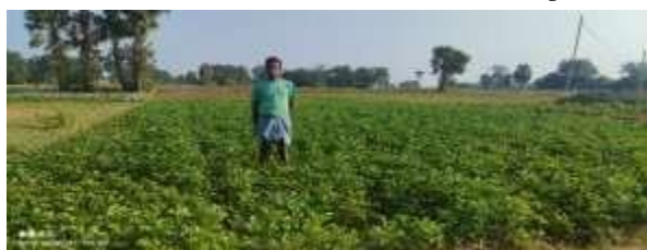
Pigeon Pea Field

Brief: The farmer used to get annual income of 104225.00 from Rice, Maize, Tomato, Ladyfinger, and Goat etc. He faced problems like unavailability of critical inputs in local market and financial support from bank. With DFI interventions like creation of irrigation facility, Use of improved variety etc. Now, he is getting annual income of Rs. 278670.00 which is Rs.143445.00 more compared to base year 2016-17 i.e.137.6% increase in income in 2020-21.