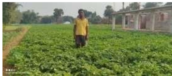
Elephant Foot yam Field