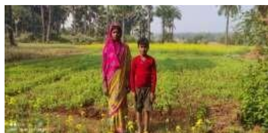
Pigeon Pea Field