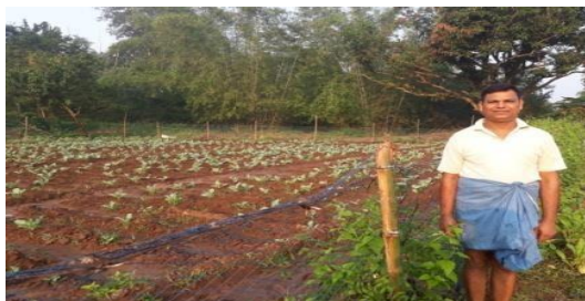
Pigeon pea Field

Brief- The farmer used to get annual income of Rs. 105850.00 from Rice, Maize, Tomato, Ladyfinger, and Cow etc. He faced problems like unavailability of critical inputs in local market and financial support from bank. With DFI interventions like creation of irrigation facility, Use of improved variety etc. Now, he is getting annual income of Rs. 603280.00 which is Rs. 4974300.00 more compared to base year 2016-17 i.e 470% increase in income in 2020-21.