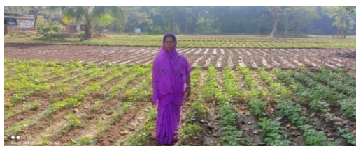
Pigeon pea Field

Brief: The farmer used to get annual income of Rs. 46460.00 from Rice, Maize, Tomato, Ladyfinger, and Cow etc. He faced problems like unavailability of critical inputs in local market and financial support from bank. With DFI interventions like creation of irrigation facility, Use of improved variety etc. Now, he is getting annual income of Rs. 232220.00 which is Rs.230160.00 more compared to base year 2016-17 i.e. 495.39 % increase in income in 2020-21.