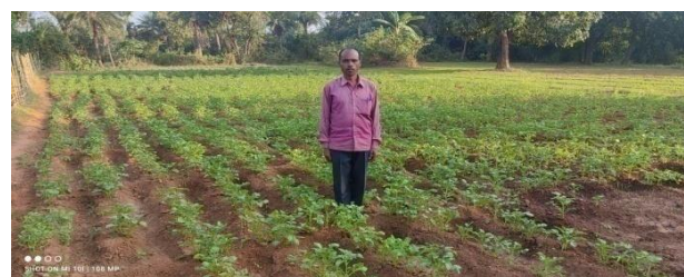
Chick pea Field