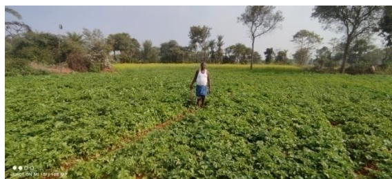
Chick pea Field

Brief: The farmer used to get annual income of Rs. 72000.00 from Rice, Maize, and Cow etc. He faced problems like unavailability of critical inputs in local market and financial support from bank. With DFI interventions like creation of irrigation facility, Use of improved variety etc. Now, he is getting annual income of Rs. 144500.00 which is Rs 72500.00 more compared to base year 2016-17 i.e. 104.69 % increase in income in 2020-21.