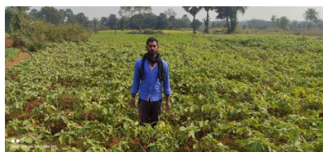
Elephant foot yam Farming