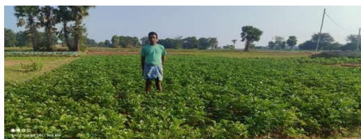
Pigeon pea field

Brief: The farmer used to get annual income of 99425.00 from Rice, Maize, Tomato, Ladyfinger, and Goat etc. He faced problems like unavailability of critical inputs in local market and financial support from bank. With DFI interventions like creation of irrigation facility, Use of improved variety etc. Now, he is getting annual income of Rs. 566940.00 which is Rs.447785.00 more compared to base year 2016-17.