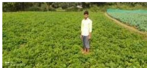
Elephant Foot yam Field