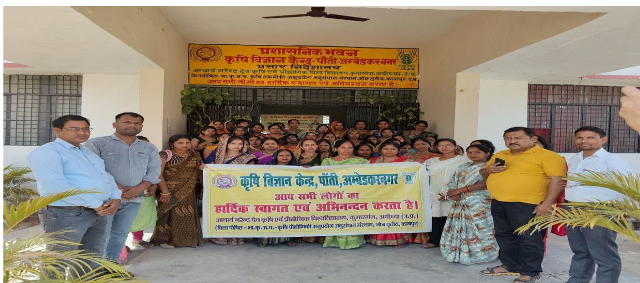
Residential tour Programme of Krishi Sakhees