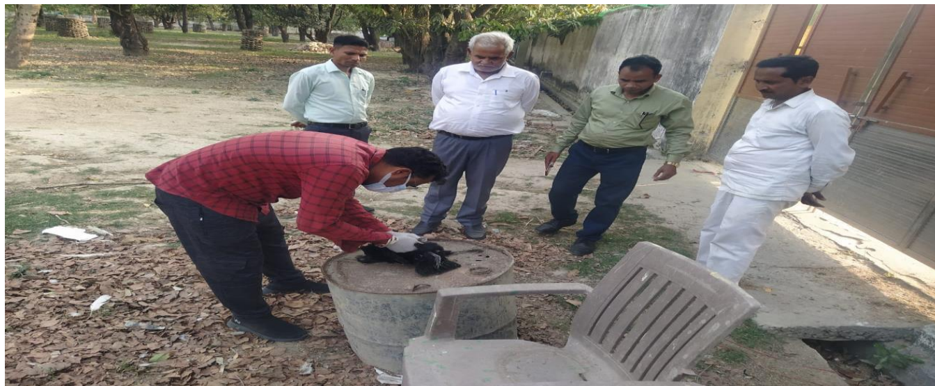
Visit for Observe and identify the disease after post -mortem