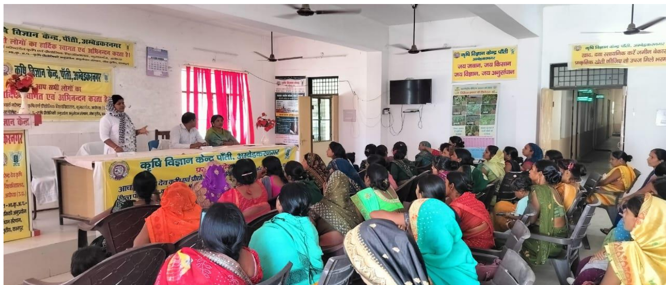
Training on Posan Thali ka mahatav