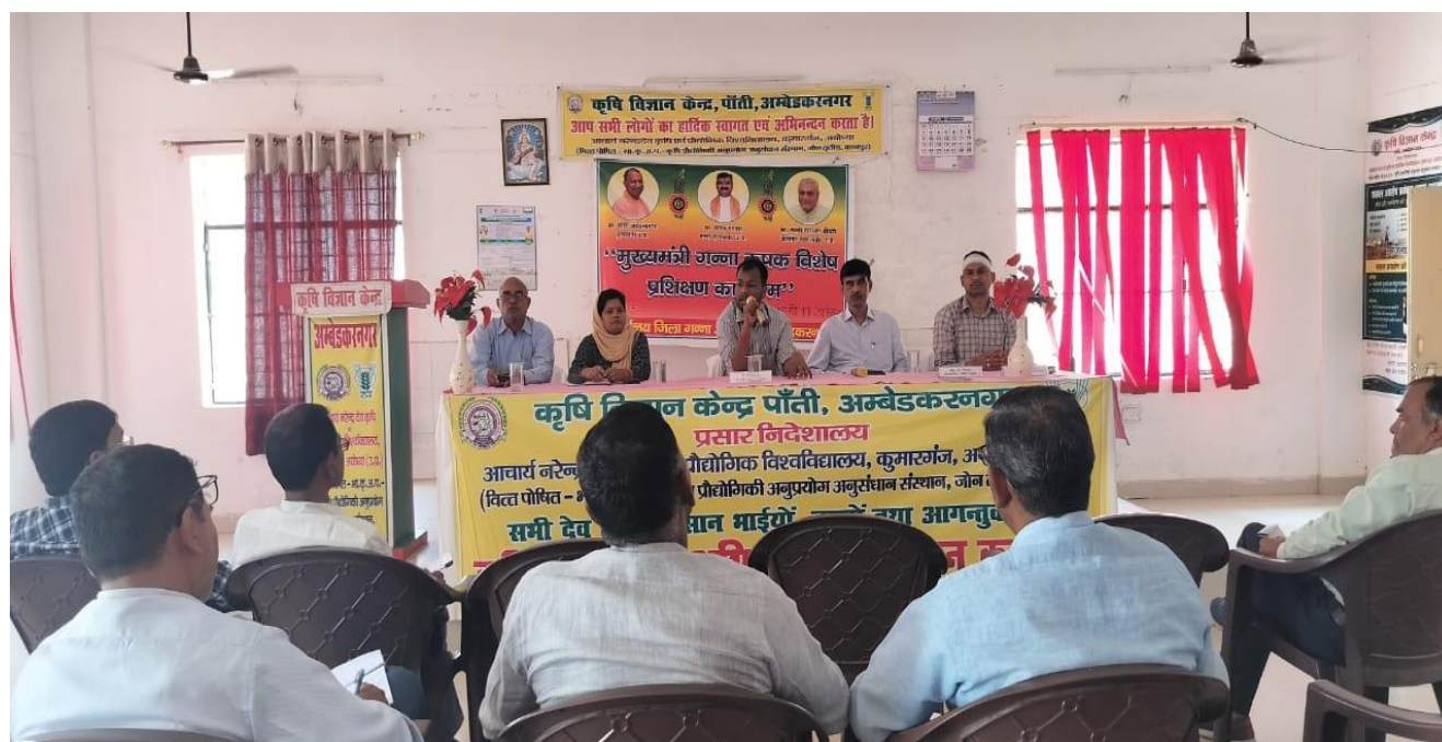
Training on Fasal Awshesh Prabandhan