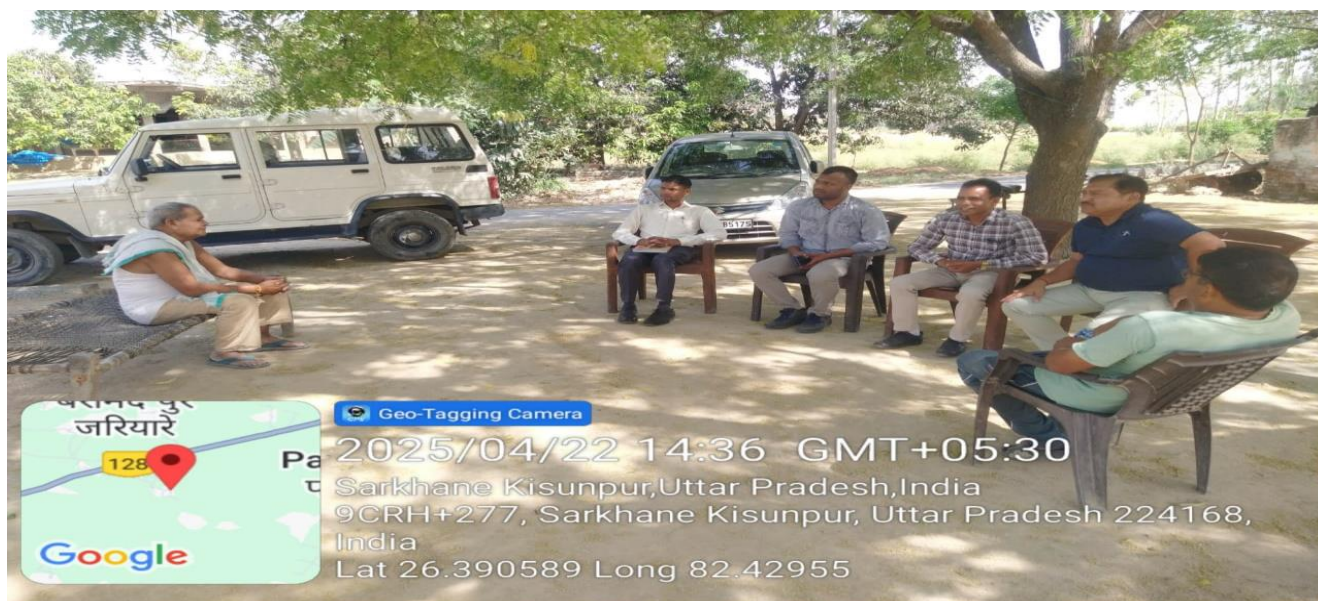
Visit to farmer field and provide suggestions by KVK scientists