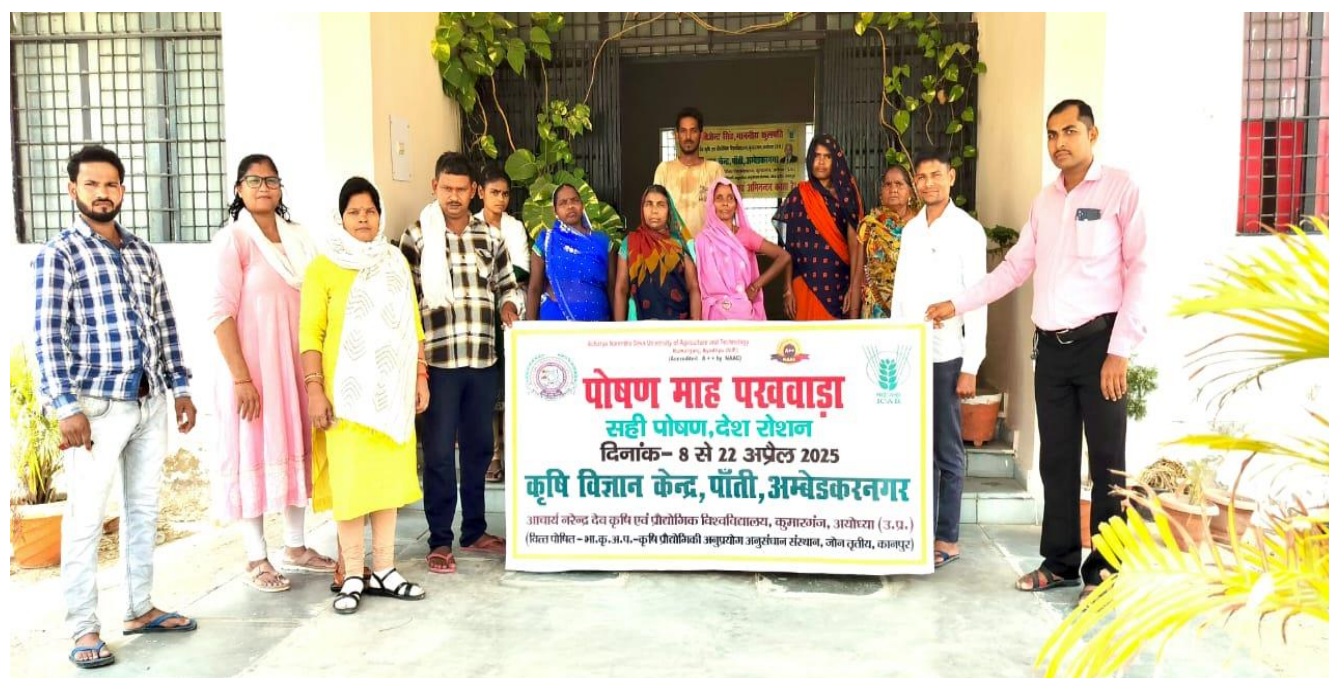
Training on Posan Thali ka mahatav