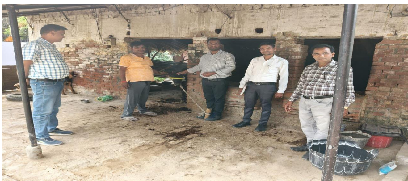
Visit for controlling disease of animals