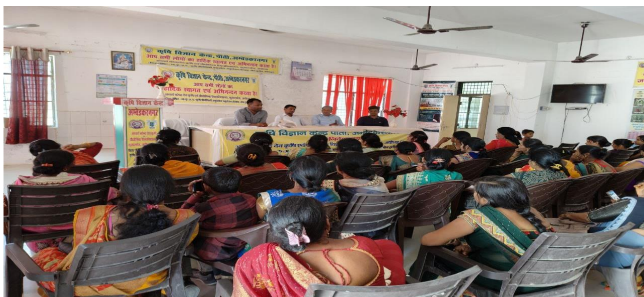
Training on Nutritional value and Importance of Balance diet