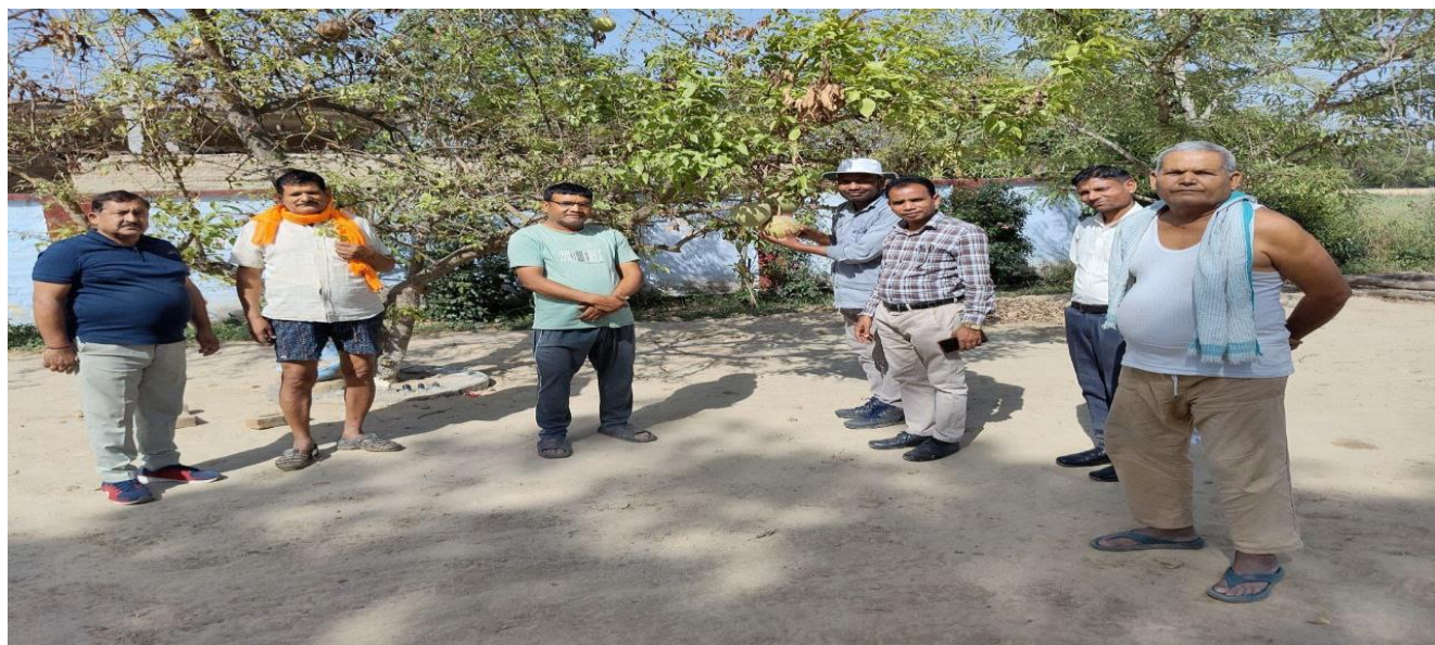
Diagnosis of bel diseases and their management